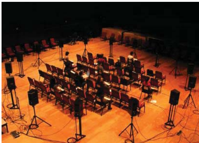
Figure 2. Measurement process in a big space

nificantly degraded and the effect of the room became more pronounced. For listeners away from the centre of the array, identification performance was confounded with the difference between the nominal and the apparent angle of incidence and angular separation and the distortion to the localization image due to violation of the symmetry with respect to the time of arrival of the speakers. In addition, considerable variation is observed in the measurements for sounds on the sides of the listeners, which can either be attributed to unfamiliarity with spatial sound experiences, but also to individual differences.