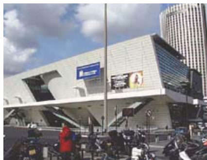
Palais des Congrès

The Paris meeting will be, by far, the largest ASA meeting in history, with over 3500 papers in 265 sessions. The previous record was actually set at the Berlin meeting, where 1955 papers were presented. Fortunately, the city of Paris is well equipped to handle a meeting of this size. The venue will be the Palais des Congrès, near the center of Paris, a modern conference center with high-quality lecture halls for oral presentations and abundant space for posters. The center also includes shops, cafes, and space to just hang out. The Palais des Congrès is just a few blocks from Étoile (Place Charles-de-Gaulle) the amazing conjunction of twelve major avenues at Napoleon's Arch of Triumph.