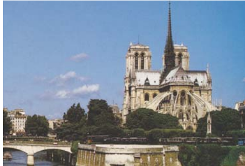
Cathédrale Notre Dame de Paris